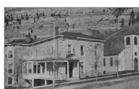
► (Top to bottom) Hospital before porch; Modern day museum; May 1987, building the porch; Hospital with carriage. St. Patrick's Church moved to Nucla in 1954. Porch added in 1906.; and, Hospital with original porch.