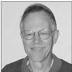
By Don Paulson OCHS Curator

In 2013 OCHS moved the museum archives over to our new research center on Main Street. This opened up a number of rooms for exhibit areas. For example, we now have a small room dedicated to the life of Otto Mears, the "Pathfinder of the San Juans," and a new area for rotating exhibits which currently features Tom Hillhouse's "Ouray Postal History" exhibit. Through the generosity of Sandra Boles, owner of North Moon Gallery, we now have five additional large, lighted display cases in the museum. Two of these are now filled with new displays on topics including the old townsite of Dallas north of Ridgway and an expanded display on Ouray Bands. In addition to these new display areas we also now have an expanded storage area for textiles including Victorian clothes, our large collection of historic wedding dresses and linens.