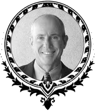
By Kevin Chismire

those who visit our museum and leave with a new found understanding of just what makes our little corner of the world - a true gem.