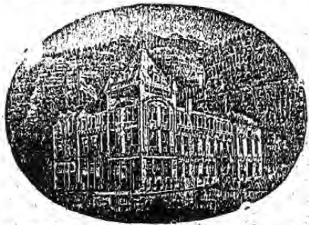
Headquarters for Tourists, Mining and Commercial Men. Best Service and table in the San Juan Country. Transient rates three to four dollars per day. OURAY, COLO.