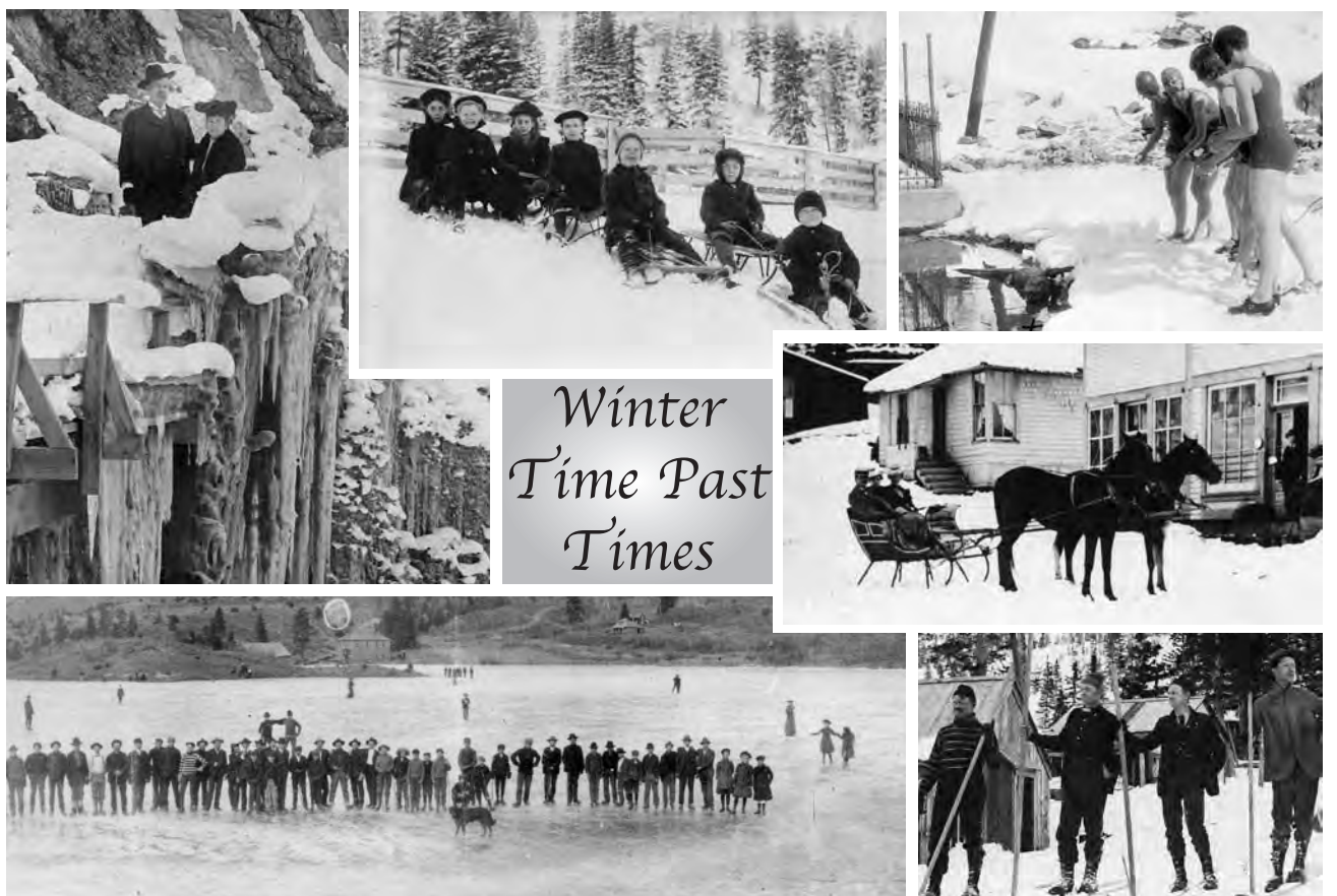
Winter Time Past Times

Further information: Ouray County Historical Society 970-325-4576